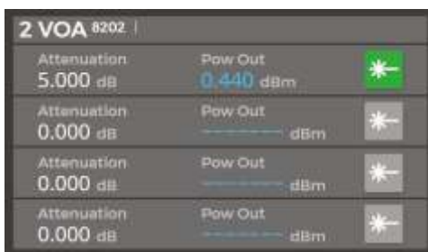
Figure 1 - mVOA MAP-300 summary view GUI

An intuitive graphic user interface (GUI) is optimized for use in either a laboratory or a manufacturing environment. Efficient transition between summary and detailed views (figure 1 and figure 2) allow users to operate at a system level or access the full power of a module.