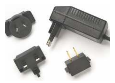
Worldwide compatible AC adapter (SNT-121A)