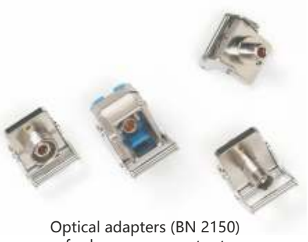
for laser source output

Wheel for precise and fast manual setting