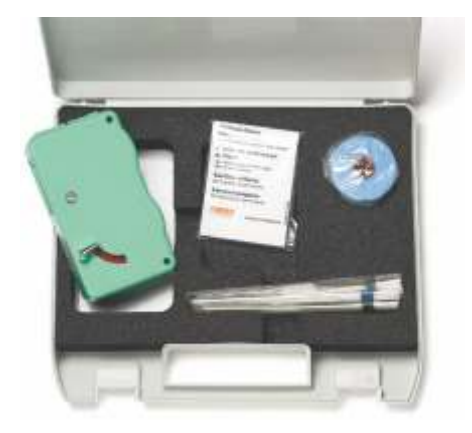
OCK-10 Optical Connector Cleaning Kit (accessory)