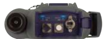
OLTS-85P quad connectors