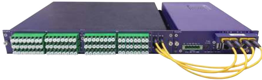
OTU-5000 with a 48 port (Test Access Point) TAP and 48 port MPO switch