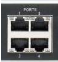
The four GbE ports provide network configuration flexibility and enhanced security. Multiple isolated and synchronized time servers can also be configured. Two 10 GbE SFP+ ports can be added for NTP/PTP operations as well.

The S650 M-Code has four dedicated and isolated GbE Ethernet ports, each equipped with NTP hardware time stamping. These are connected to a high-speed microprocessor with microsecond-accurate time stamps to assure high-bandwidth NTP performance. This exceeds the need of servicing 10,000 NTP requests per second with no degradation in time stamp accuracy.