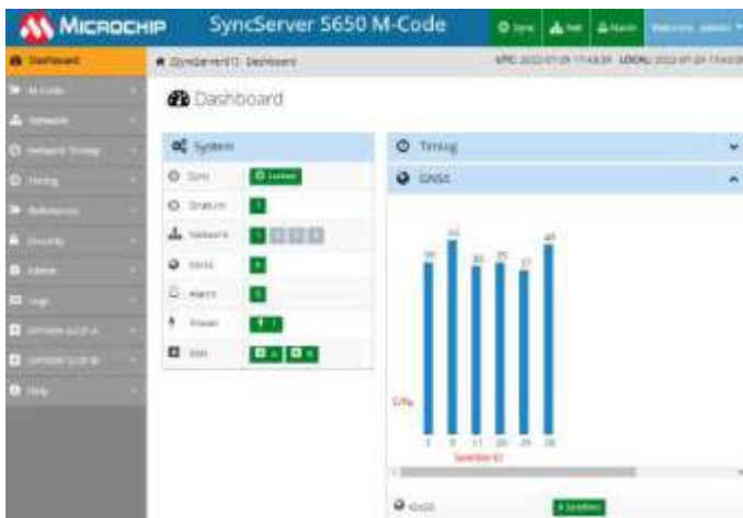
At-a-glance dashboard presentation combined with logical organization and intuitive controls that make configuring the S650 M-Code easy.

The modern web interface is the primary control interface of the S650. Once the keypad and display bring the unit online, complete status and control functions are easily found on the left navigation menu.