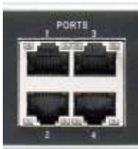
The four GbE ports provide network configuration flexibility and enhanced security. Multiple isolated and synchronized time servers can also be configured. Two 10 GbE SFP+ ports can be added for NTP/PTP operations as well

The S600 has four dedicated and isolated GbE Ethernet ports, each equipped with NTP hardware time stamping. These are connected to a high-speed microprocessor with microsecondaccurate time stamps to assure high-bandwidth NTP performance. This exceeds the need of servicing 10,000 NTP requests per second with no degradation in time stamp accuracy..