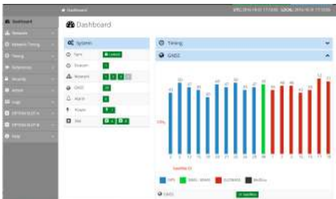
At-a-glance dashboard presentation combined with logical organization and intuitive controls that make configuring the S600 easy

The modern web interface is the primary control interface of the S600. Once the keypad and display bring the unit online, complete status and control functions are easily found on the left navigation menu. A REST API also included.