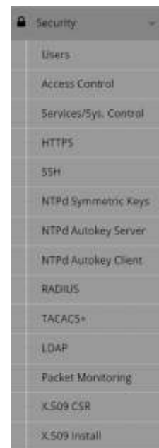
An entire drop-down menu in the S600 dedicated to security related protocols.

Authentication hardening is available for NTP client/server authentication through the NTP Autokey function or user access authentication through TACACS+, RADIUS, and LDAP. Third party CA-signed X.509 certificates are installable for further hardening of management access. For more information about the protocol license option, see the SyncServer Options datasheet.