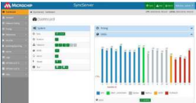
At-a-glance dashboard presentation combined with logical organization and intuitive controls that make configuring the S650 easy

The modern web interface is the primary control interface of the S650. Once the keypad and display bring the unit online, complete status and control functions are easily found on the left navigation menu. A REST API also included.