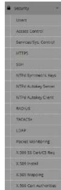
An entire drop-down menu in the S650 dedicated to security related protocols.

Authentication hardening is available for NTP client/server authentication through the NTP Autokey function or user access authentication through TACACS+, RADIUS and LDAP. Third party CA-signed X.509 certificates are installable for further hardening of management access and secure syslog operations. For more information about the Security Protocol License option, see the SyncServer Options datasheet.